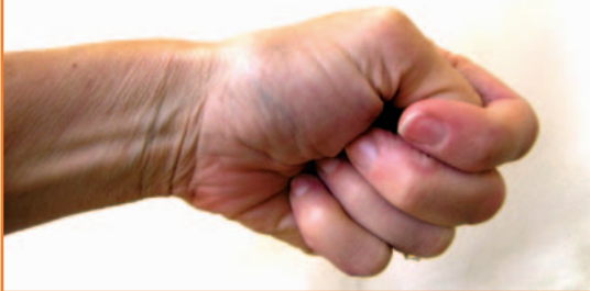
Figure 2 and 3: Finkelstein maneuver, a helpful test to diagnose de Quervain's Tendonitis. Figure 2 shows the first dorsal compartment relaxed; Figure 3 shows the compartment stretched when the fist is bent toward the little finger.

Tenderness directly over the tendons on the thumb-side of the wrist is the most common finding. A test is generally performed in which the patient makes a fist with the fingers clasped over the thumb. The wrist is then bent in the direction of the little finger (see Figure 2 and 3). This maneuver can be quite painful for the person with de Quervain's tendonitis.